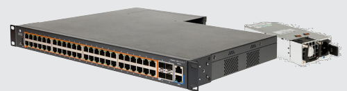
EX2052R-P / CRPS