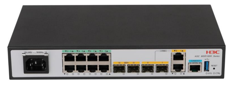
H3C MSR1008 router