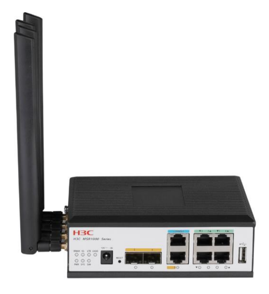
H3C MSR1004S-5G-GL router